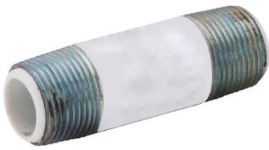
Thread x Thread