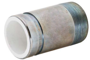
Thread x Groove